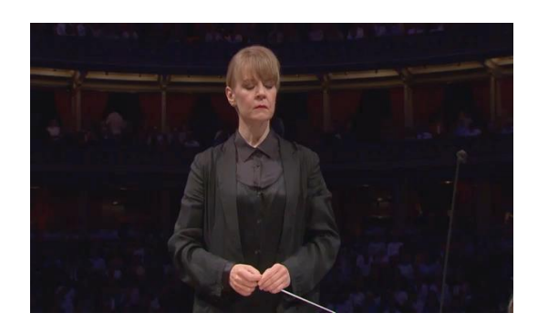
The Western Classical Tradition up to the 1940s